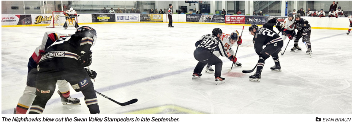
The Nighthawks blew out the Swan Valley Stampeders in late September.

The Nighthawks continued their strong start with a dominant 6-0 road