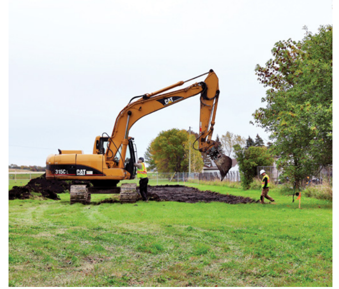
The excavation at 420 Main Street in St. Adolphe.

"The collaboration between the municipality and developer, as well as citizen engagement, is supporting a