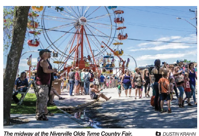
The midway at the Niverville Olde Tyme Country Fair.

That has been changing over the years, he says, but never more drastically than